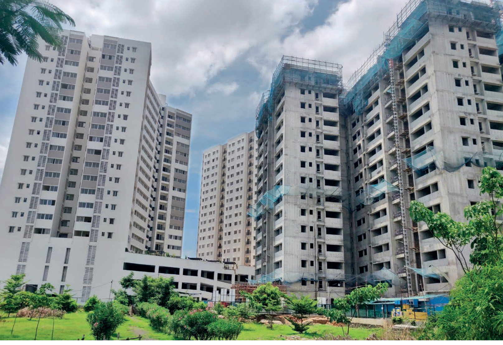
Godrej SSPDL AZURE Residential Project at Kalipathur, OMR, Chennai