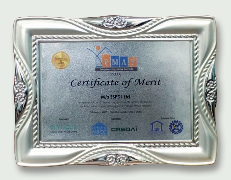
Pradhan Mantri Awas Yojana, Ministry of Housing and Urban Affairs