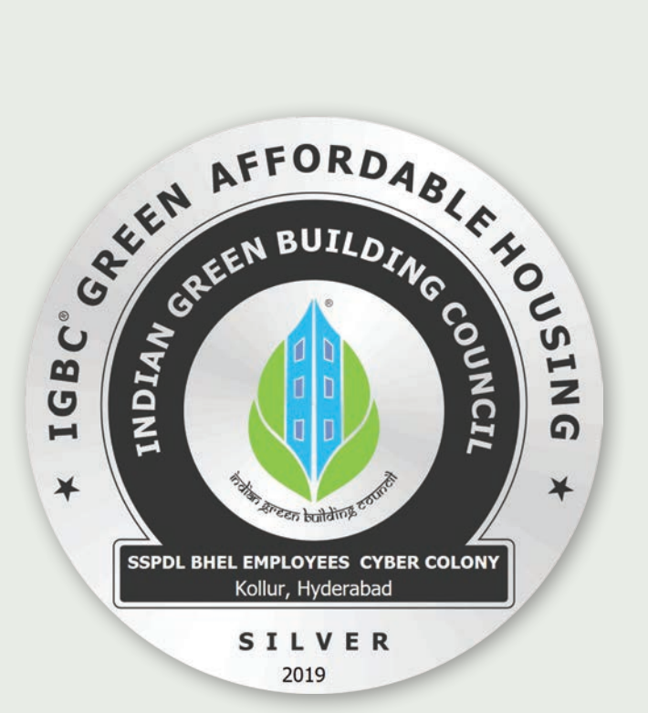
Indian Green Building Council (IGBC)