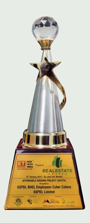
Real Estate Awards Affordable Housing Project (South) from ET NOW