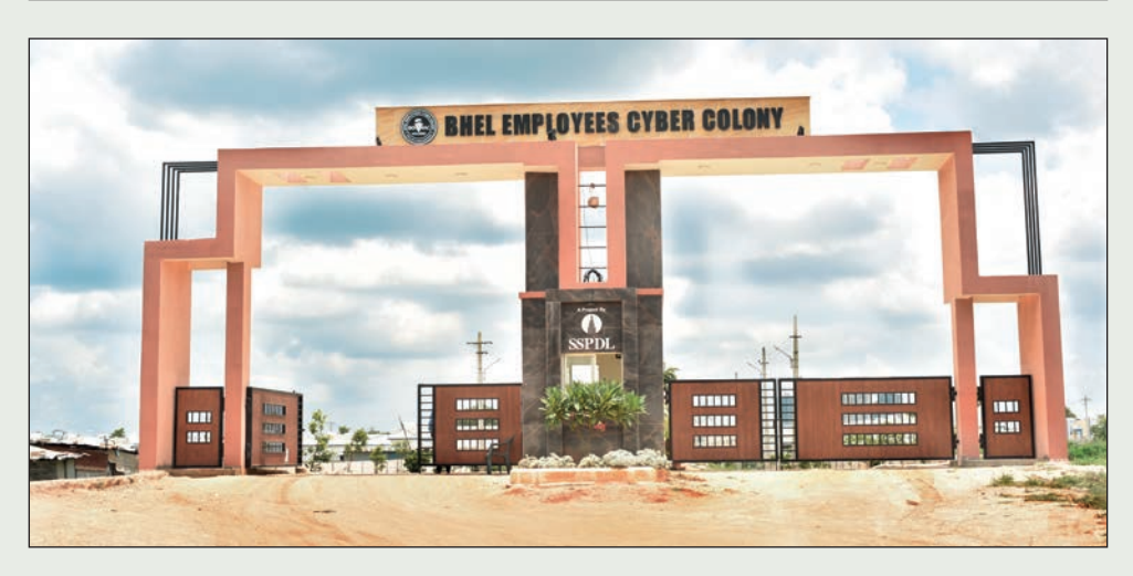
Our Villa and Apartments Project at Kollur Osman Nagar, Hyderabad